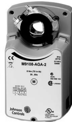
M9108 Series Electric Non-Spring-Return Actuators

The -GGx, -HGx, and -JGx models employ noise-filtering techniques on the control signal to eliminate repositioning due to line noise.